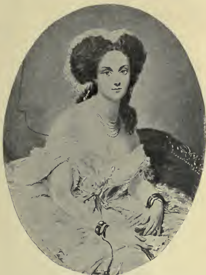
THE COUNTESS CASTIGLIONE.